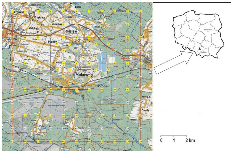
Fig. 1. Sampling sites in the region close to MMP “Boleslaw” SA [9]

Also total chromium concentrations were assessed in all collected soil samples. The samples were dissolved in a mixture of nitric and perchloric acids (2:1, v/v), after previous organic matter mineralization in a muffle furnace at 450 °C [10].